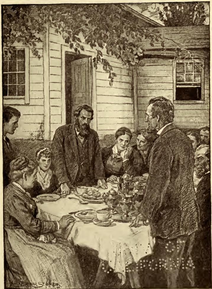
The shadows were long on the grass when father rose to reply. P. 236