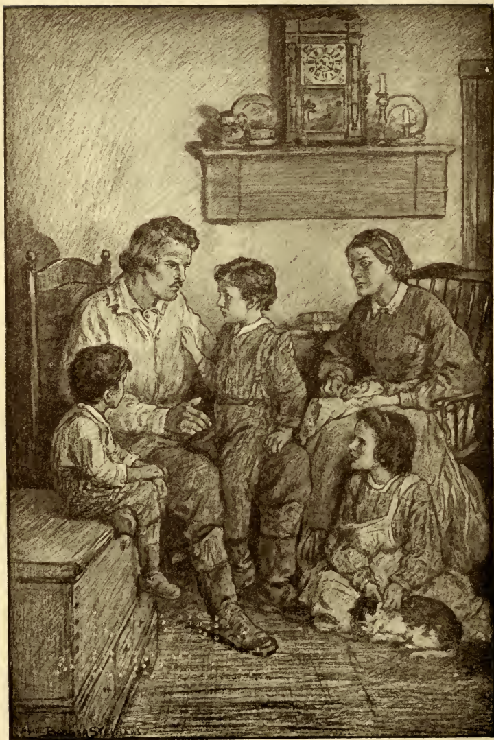
Father often invited us to his knees. P. 47