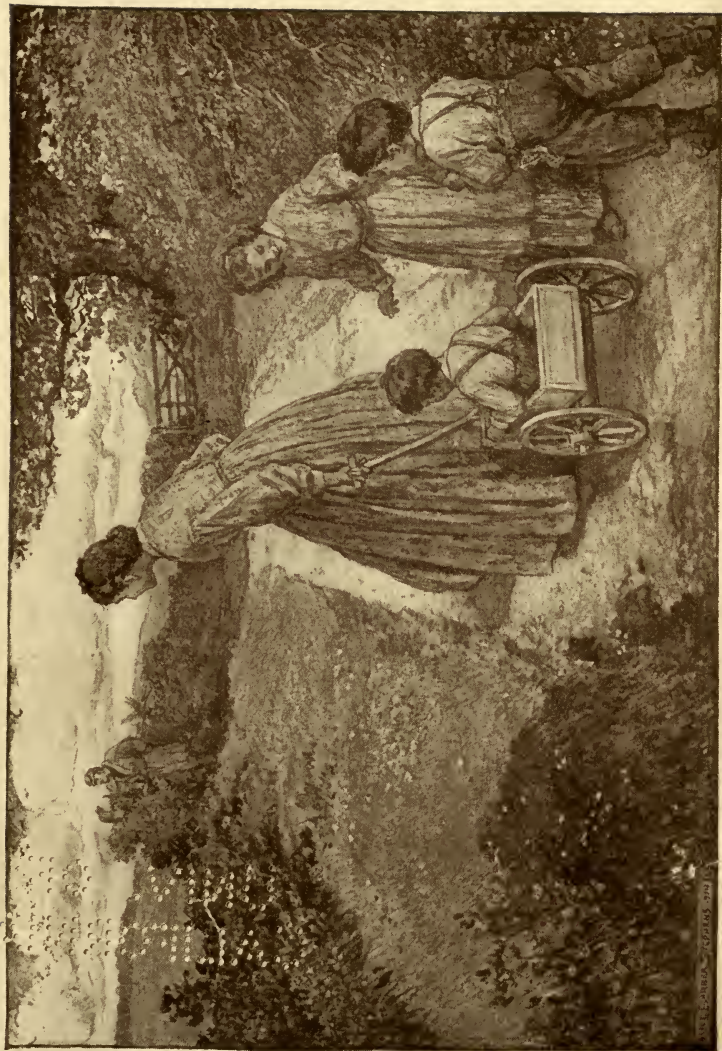
My father's return from the war