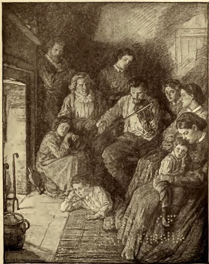
As he played I was a boy again, lying before the fire. P. 452